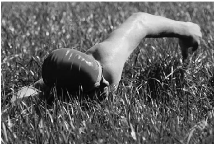
Over-watering your lawn?

North Marin Water District, in partnership with Sonoma County Water Agency and other Marin and Sonoma water utilities, have developed a list of the Top Ten Water Conservation Tips for customers to follow and help reduce water usage by 15%. These tips are consistent with NMWD's Emergency Water Conservation Ordinance.