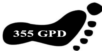
Typical Novato Annual Household Water Use Footprint (Gallons Per Day)