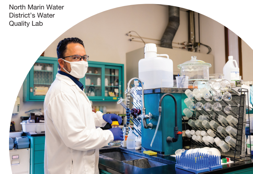
North Marin Water District's Water Quality Lab

Construction of a second well on the Gallagher Ranch and initial water quality testing is currently underway. Permitting for this well to make its water available for delivery to our customers should be completed by autumn of this year.