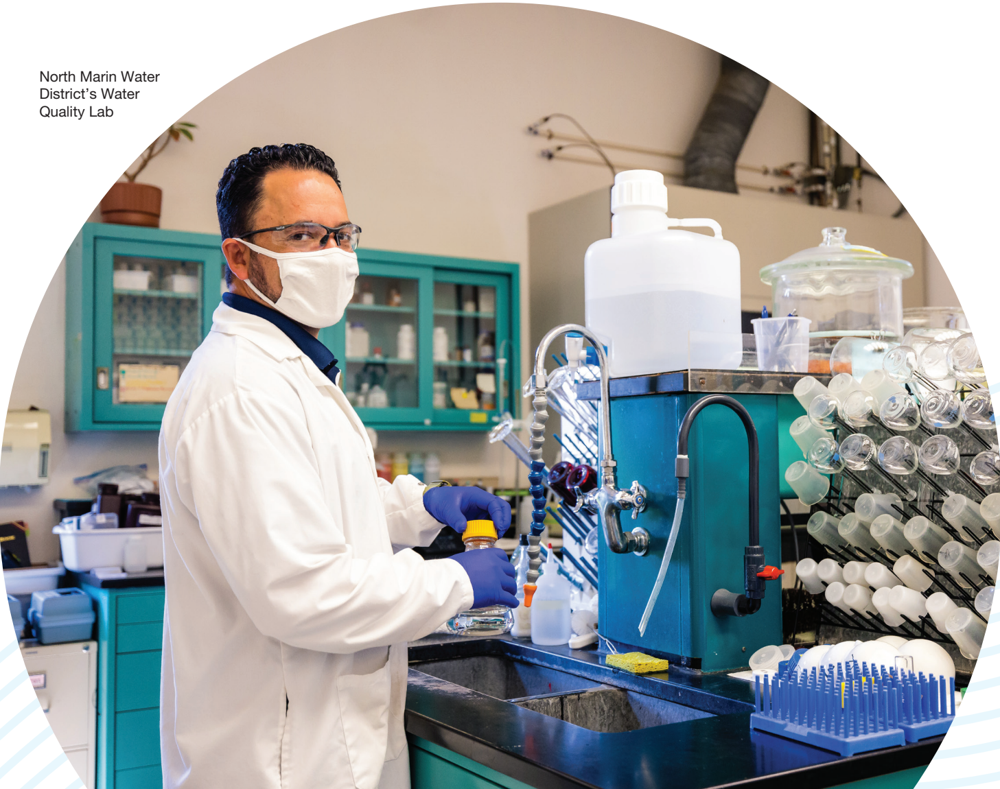
North Marin Water District’s Water Quality Lab