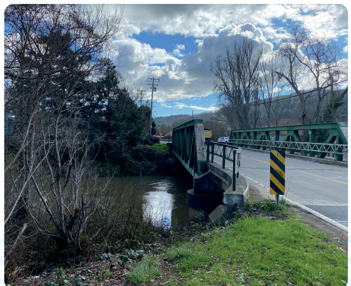
Lagunitas Creek Bridge